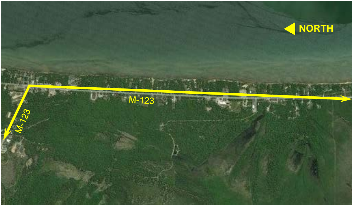
Figure 1: The Paradise study area can presently statistically support an additional 24,100 sf of retail and restaurant development.